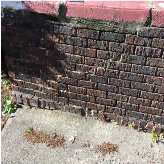
Masonry Step Crack (Side D of Porch)