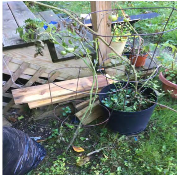
Little Garden (Side C)