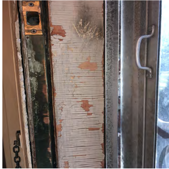
Deteriorated Exterior Door Jamb