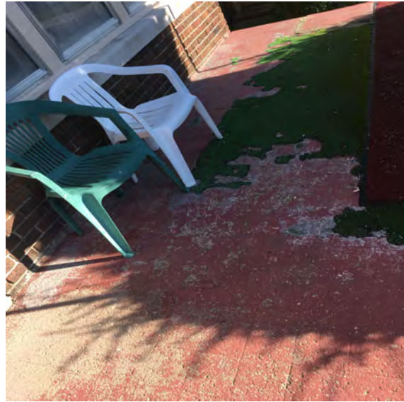
Deteriorated Concrete Porch Floor