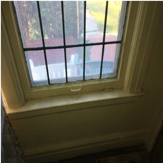
Child Licks Window Sill (Living Room A Wall)