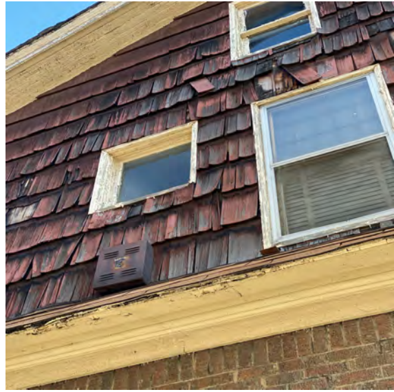
Painted Wood Shake & Deteriorated Sashes