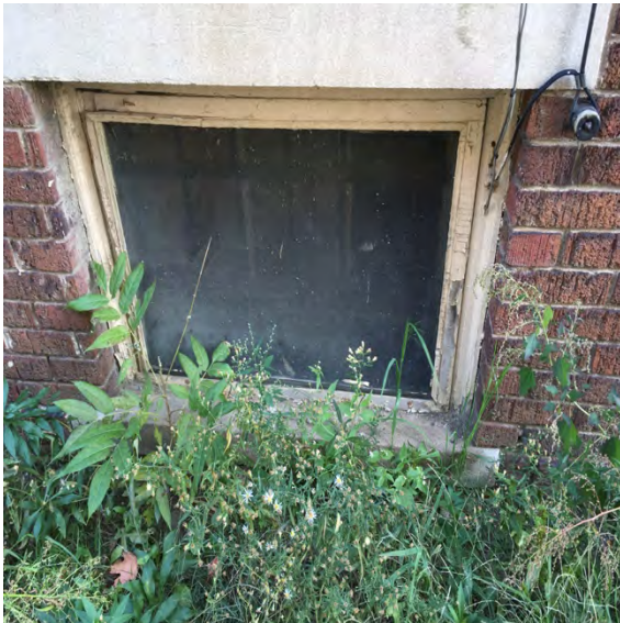
Cellar Windows Covered with Storm Sashes