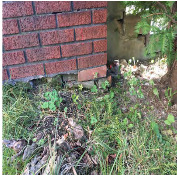
Cracks on Side D of Porch