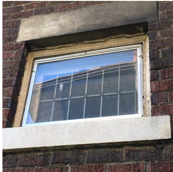
Deteriorated Exterior Window Casing on Fixed Window