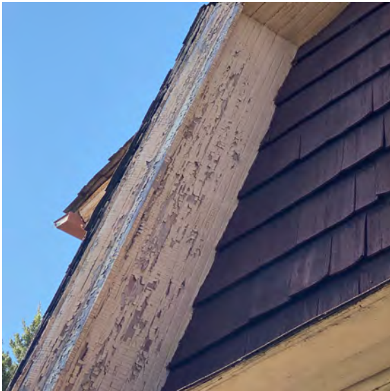
Deteriorated Roof Rake & Soffit