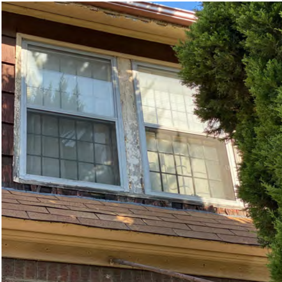
Deteriorated Exterior Window Components