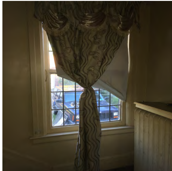
Child Licks Window Sill (Living Room C Wall)