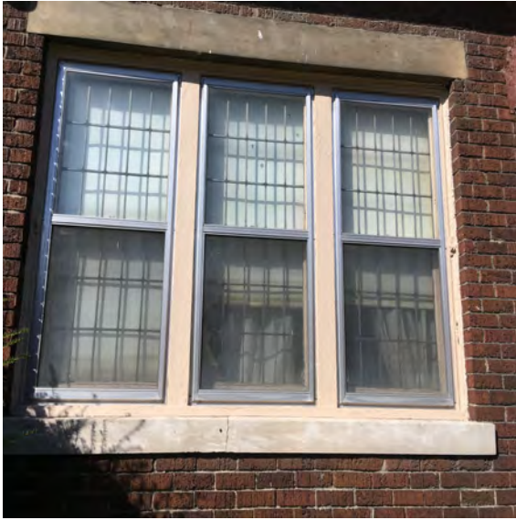
Most Windows are covered with Storm Sashes