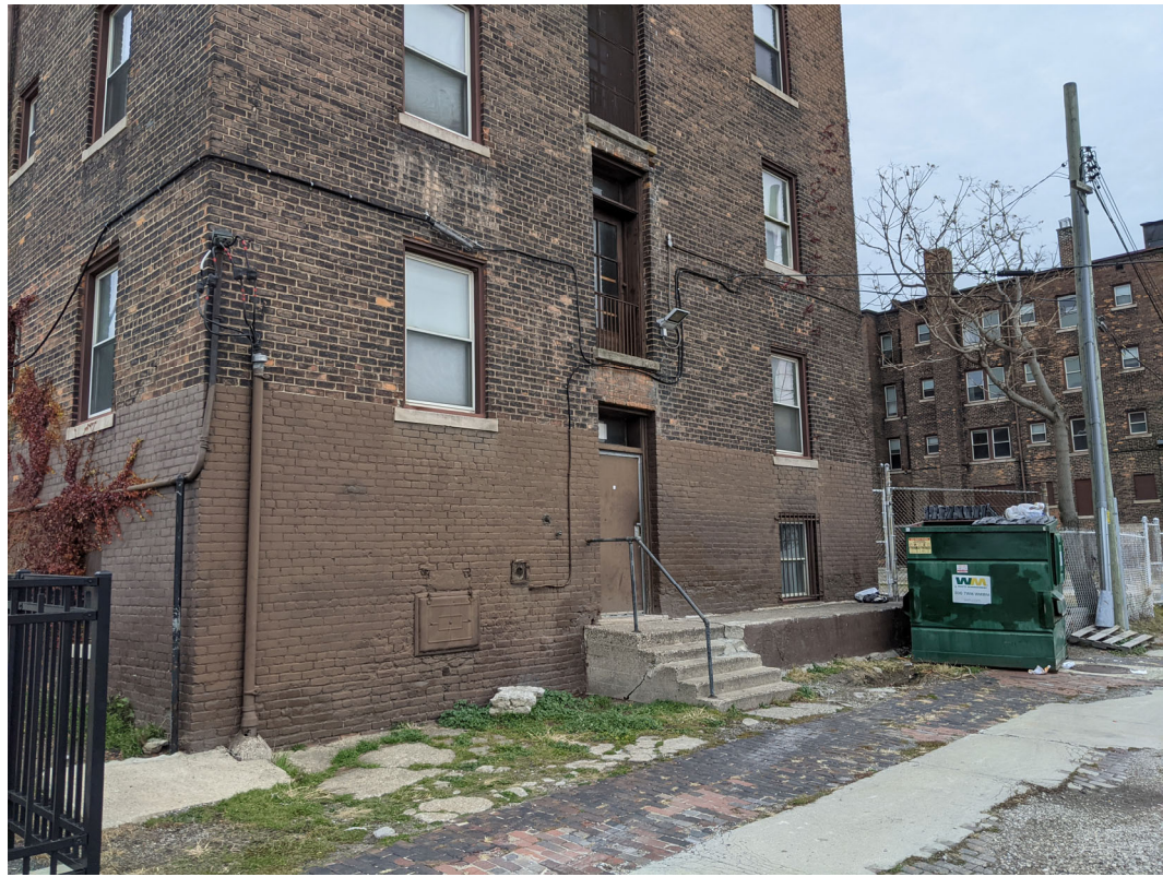
View of rear (south) elevation at alley. Staff photo, November 24, 2020.