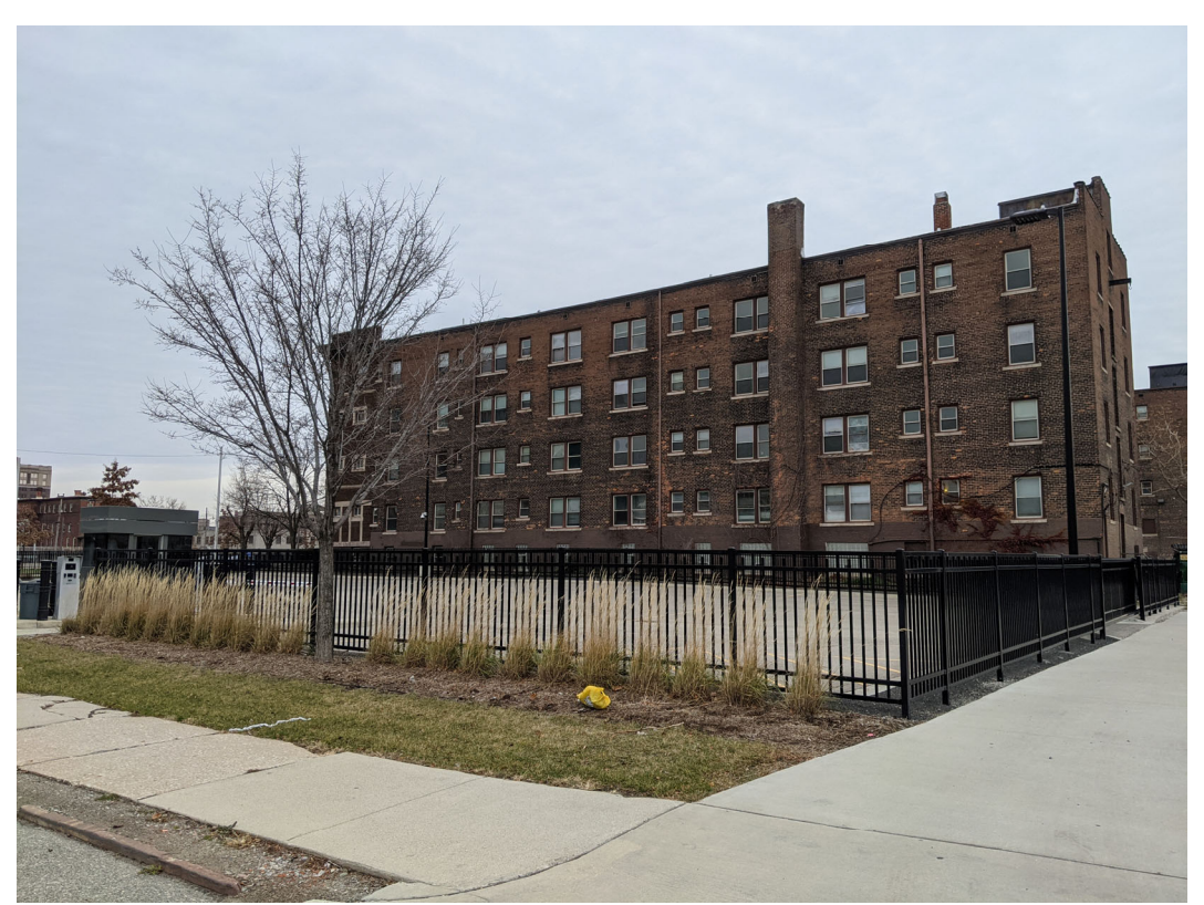
Distant view of the Berwin's west elevation, marking the western edge of the historic district, as seen from Second Avenue. The parking lot in the foreground is excluded from the district. View to the northeast. Staff photo, November 24, 2020.

Additional photographs, renderings, presentation materials, and narrative provided by the applicant in support of this application is appended to this report and posted on the public website for the meeting.