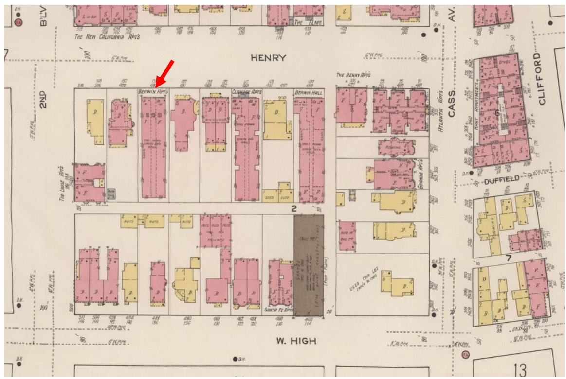
Cass-Henry vicinity, 1921 Sanborn map showing original urban density near the end of the Period of Significance. Arrow points to 489 Berwin. Note preponderance of brick (red) buildings, versus frame (yellow) structures. "D" indicates a single-family "dwelling," while "F" indicates rental "flats" or apartment houses.