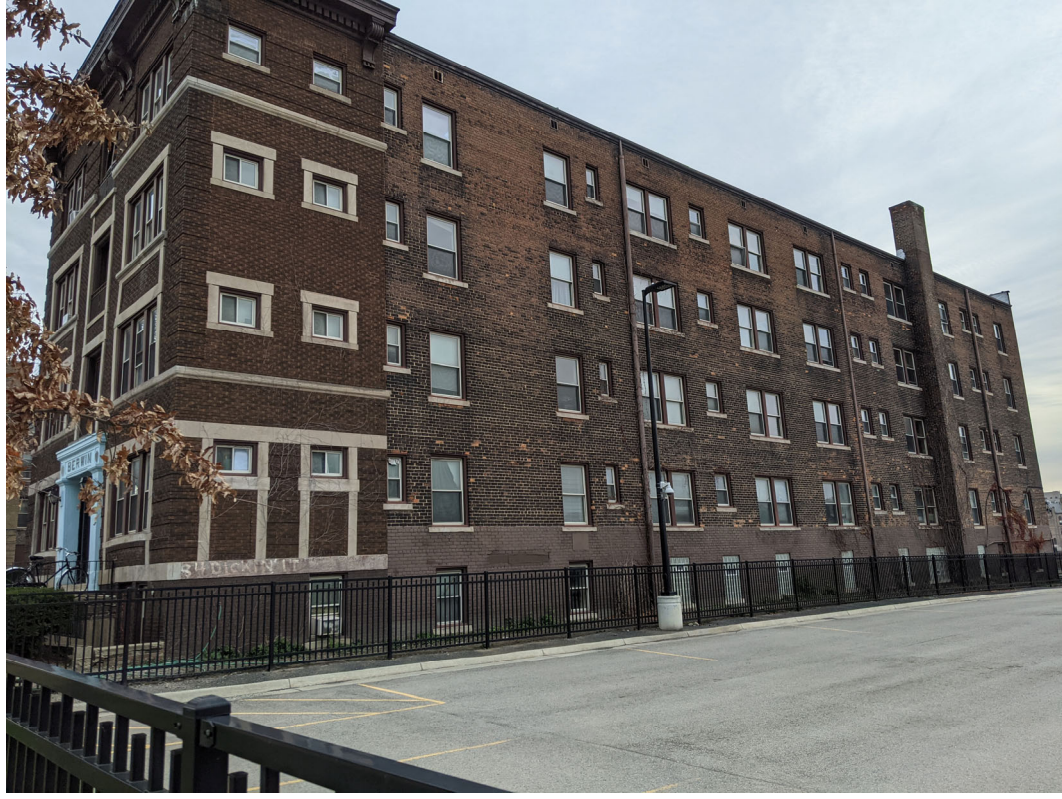
West elevation. The lot in the foreground is not in the district. Staff photo, November 24, 2020.