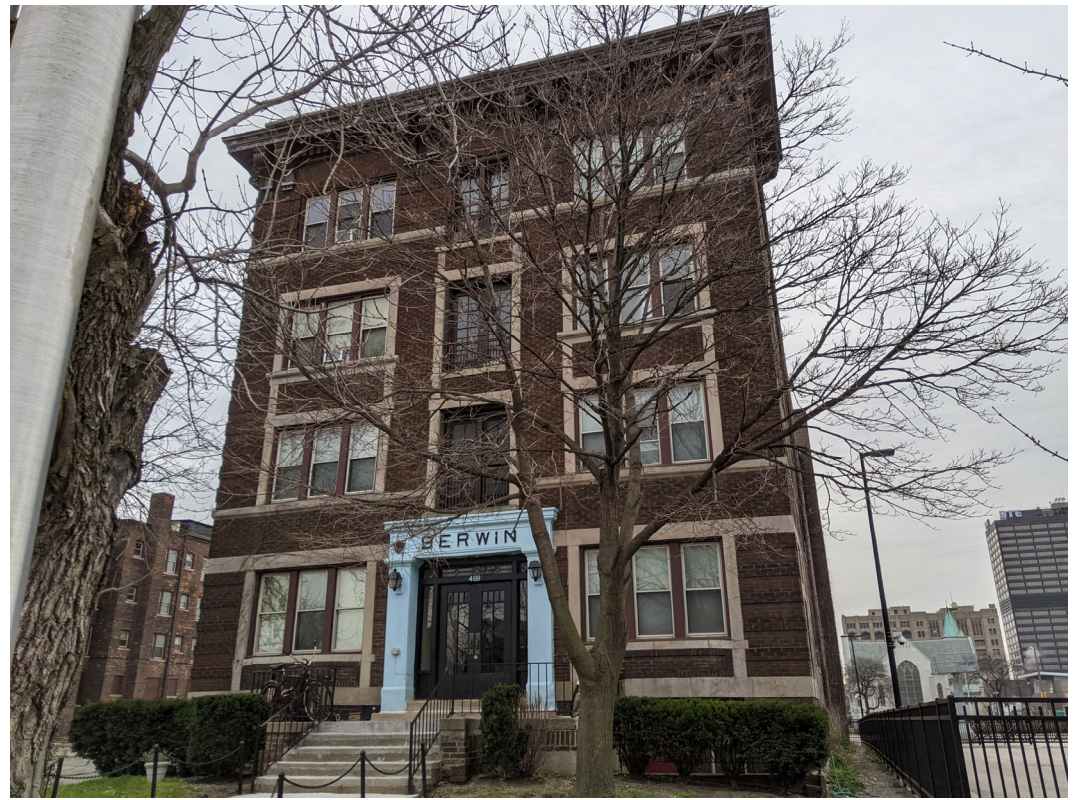
View of the Berwin Apartments, view to the south. November 24, 2020.