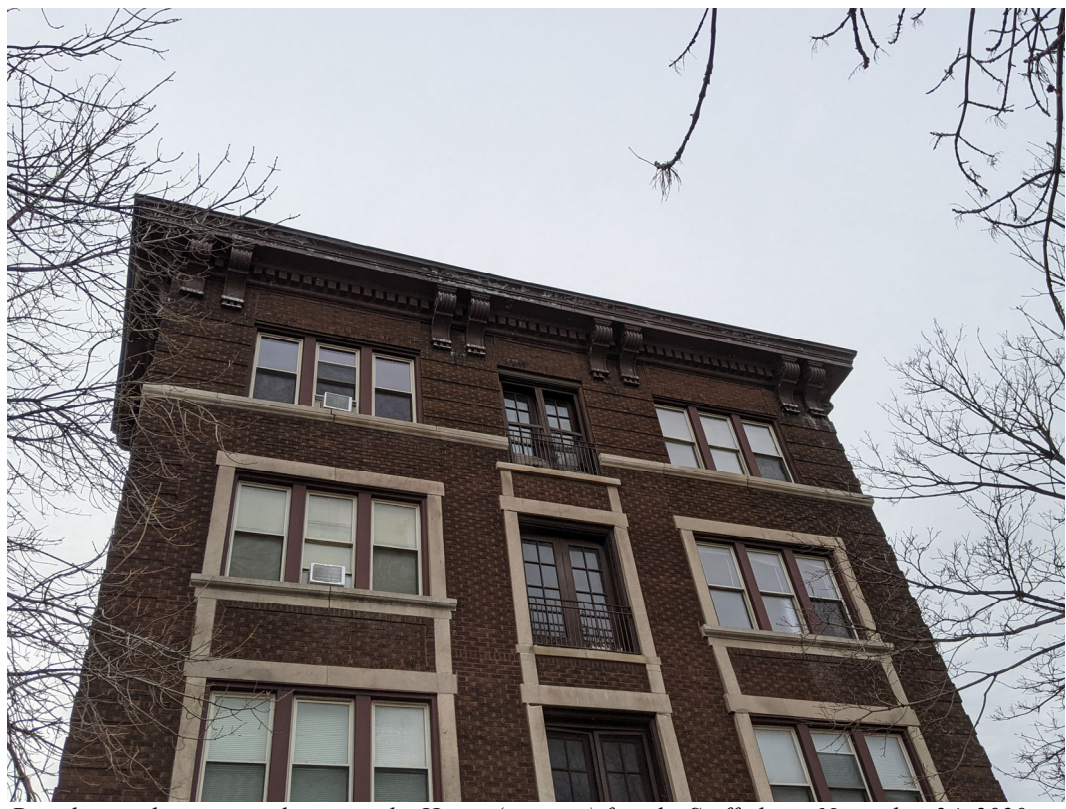
Detail view showing conditions at the Henry (primary) facade. Staff photo, November 24, 2020.