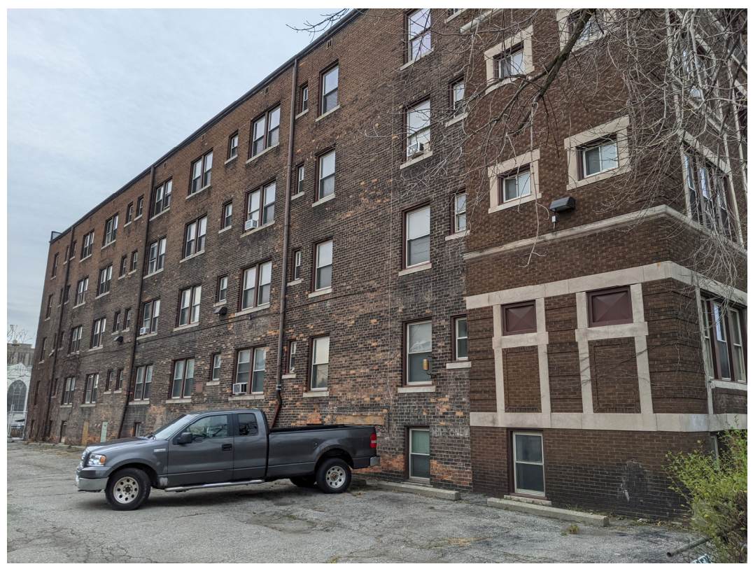
View of East elevation, adjacent to parking lot at 481 Henry. Staff photo, November 24, 2020.