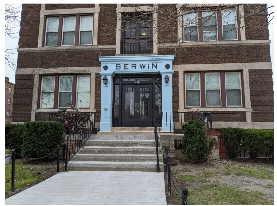
Detail view showing main entrance at Henry, note "BERWIN" name above. November 24, 2020.