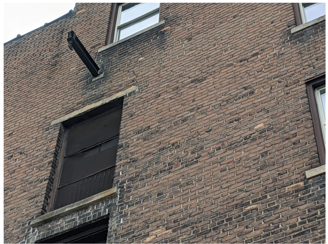
Detail view of brick and furniture hoist beam at top of rear elevation. Staff photo, December 7, 2020.