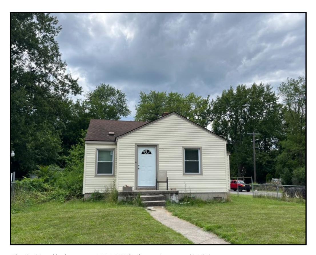
Single-Family house – 18315 Winthrop Avenue (1943)

(M-10) expressway, north of McNichols Road, and south of Seven Mile Road, the house is located in the College Park section of the Belmont district in northwest Detroit. Placed on generally flat terrain, Winthrop Street is twenty to twenty-one feet wide and oriented in a north-south direction. Sidewalks line each side of Winthrop Street and the houses on Winthrop Street are set back from the road by a berm with a few mature trees remaining in the berm in the center of the block.