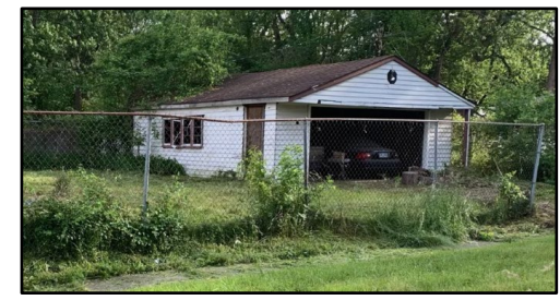
Noncontributing garage structure

garage façade, and a pedestrian entry door is at the north side of the east façade also. The roof of the garage is finished with light brown shingles, matching those on the house.