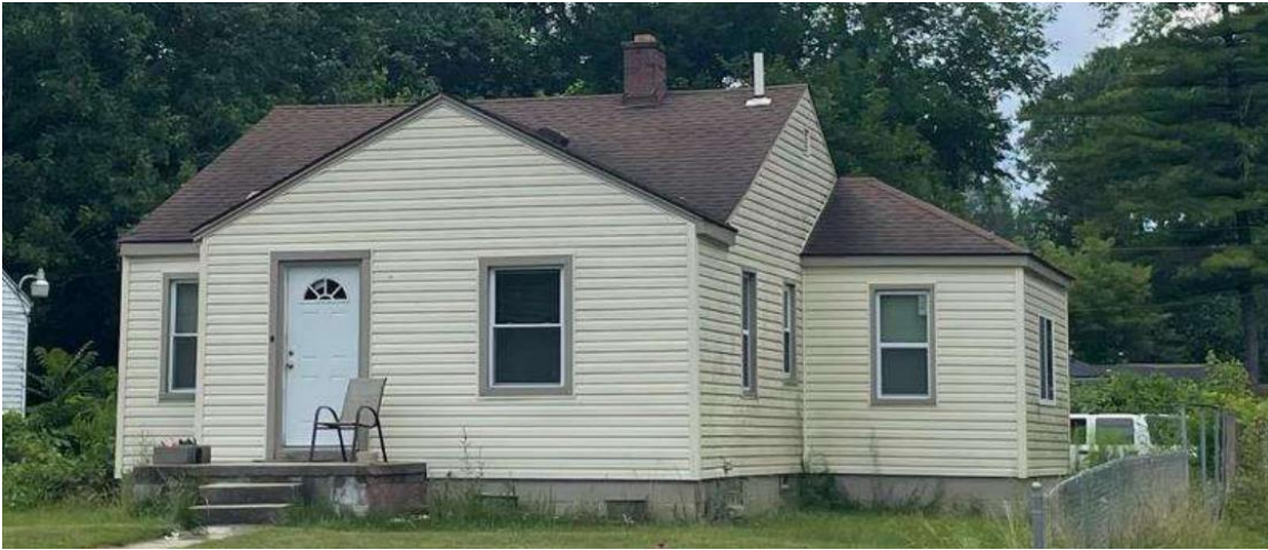
Undated Historic Designation Advisory Board photo.