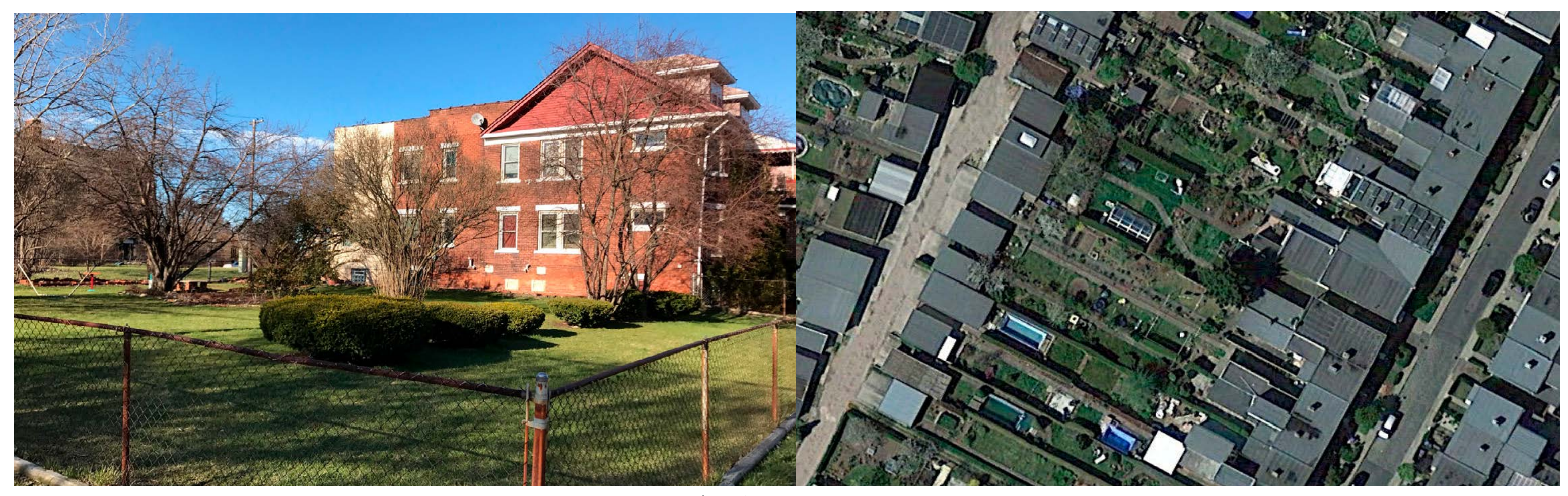
ROSA PARKS CLAIRMOUNT NEIGHBORHOOD REVITALIZATION COMMUNITY FORUM 2 | April 6, 2017