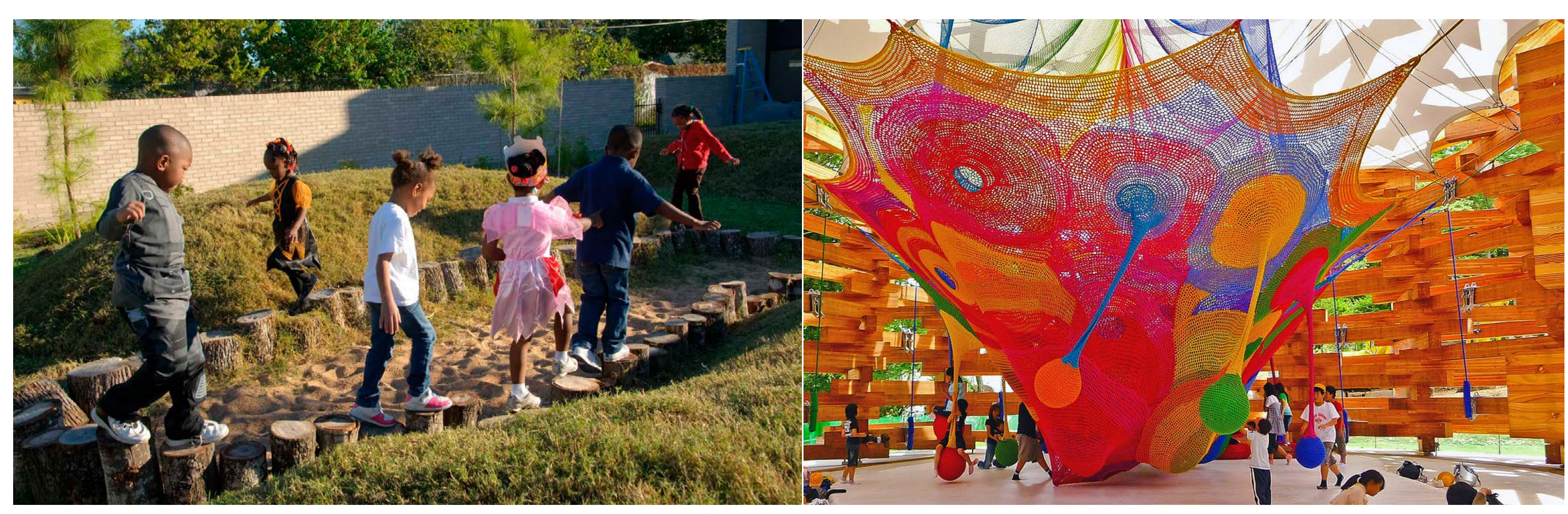
ROSA PARKS CLAIRMOUNT NEIGHBORHOOD REVITALIZATION COMMUNITY FORUM 2 | April 6, 2017