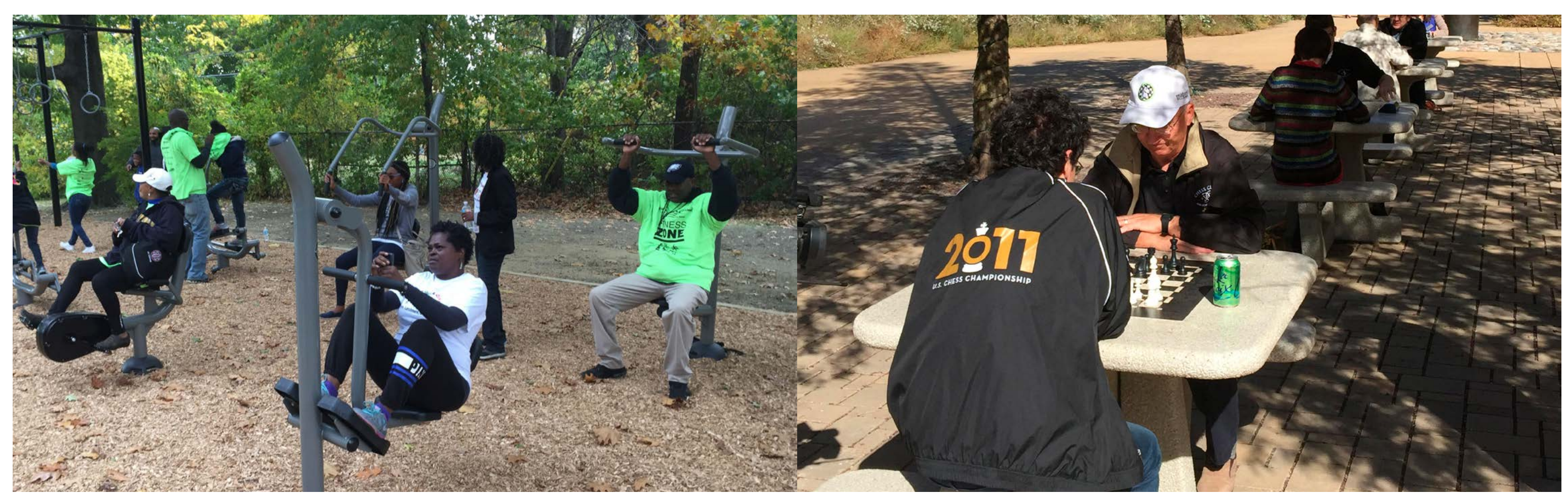
ROSA PARKS CLAIRMOUNT NEIGHBORHOOD REVITALIZATION COMMUNITY FORUM 2 | April 6, 2017