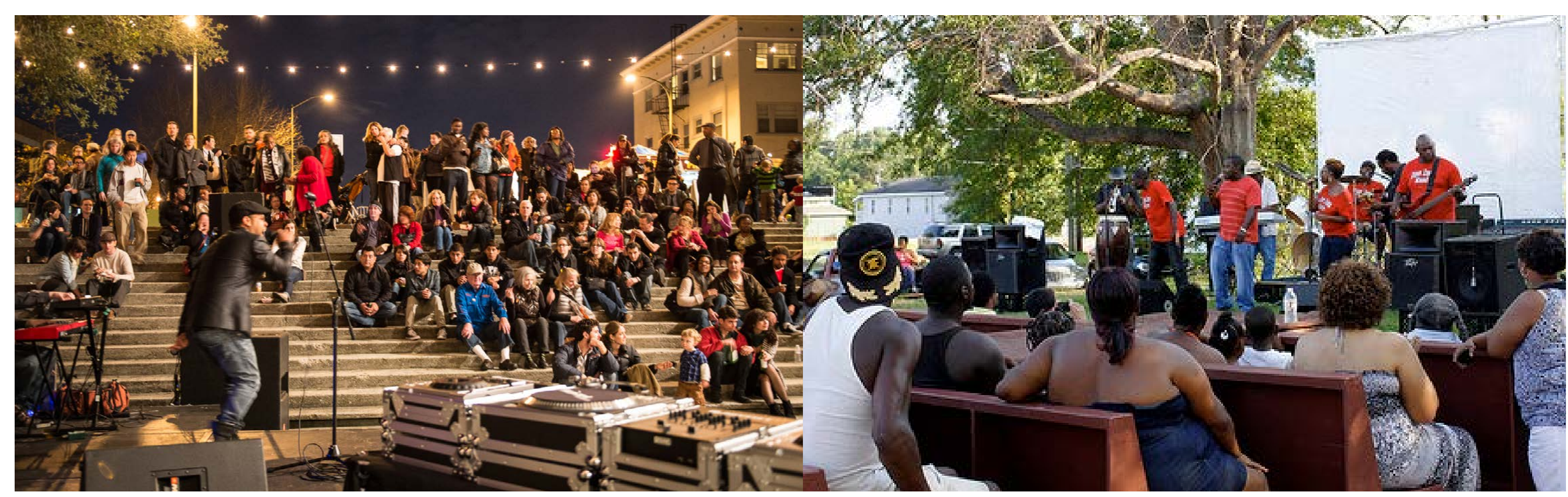
ROSA PARKS CLAIRMOUNT NEIGHBORHOOD REVITALIZATION COMMUNITY FORUM 2 | April 6, 2017