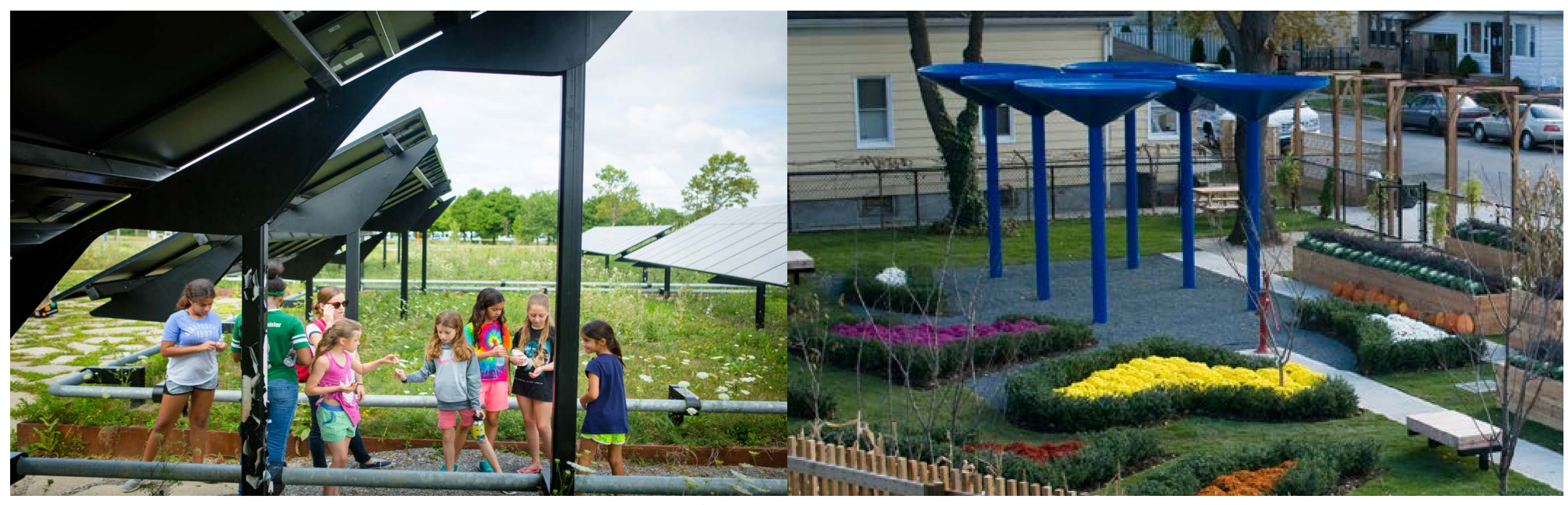
ROSA PARKS CLAIRMOUNT NEIGHBORHOOD REVITALIZATION COMMUNITY FORUM 2 | April 6, 2017