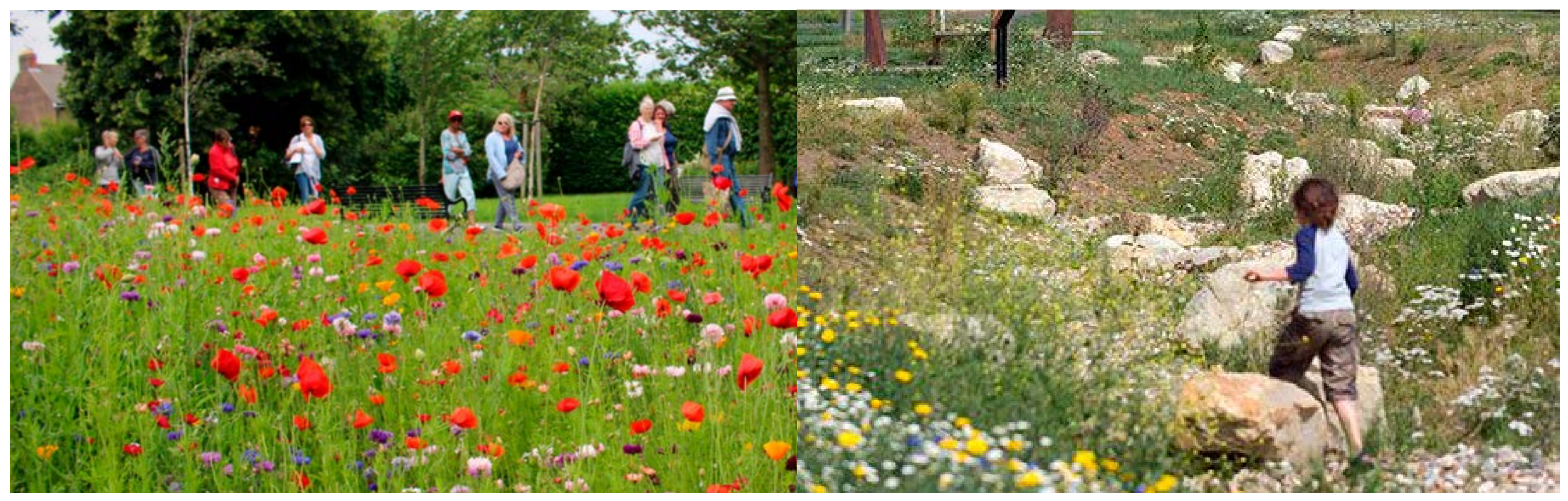
ROSA PARKS CLAIRMOUNT NEIGHBORHOOD REVITALIZATION COMMUNITY FORUM 2 | April 6, 2017