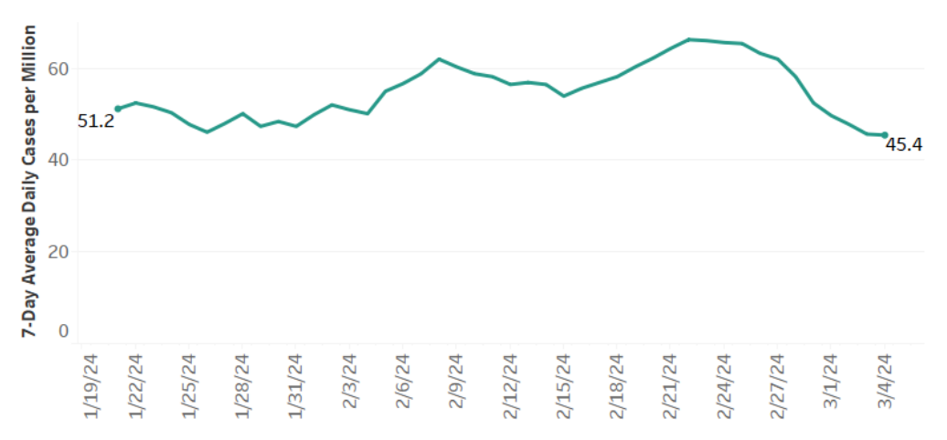
Figure 1: COVID-19 confirmed (daily/1,000,000) cases

The 7-day average rate of new confirmed COVID-19 cases among City of Detroit residents is 45.4 daily cases per million people as of 03/04/2024. This has decreased compared to the previous report, when it was reported as 62.9 cases per million people.