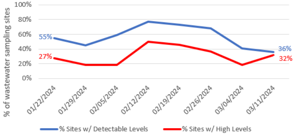
Figure 4: SARS-CoV-2 Wastewater Levels

The proportions are out of 22 sites across the city of Detroit from which wastewater samples are taken and tested for SARS-CoV-2 markers. Each sampling site represents a specific population based on the area its sewer shed covers, such as long-term care facilities, college dormitories, and entire ZIP code areas. Detectable levels are over 1000 copies/100mL; high levels are over 5000 copies/100mL.