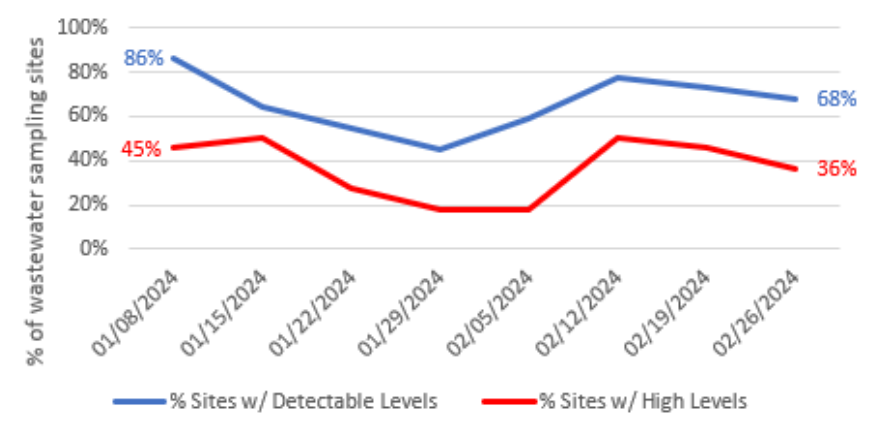
Figure 4: SARS-CoV-2 Wastewater Levels

The proportions are out of 22 sites across the city of Detroit from which wastewater samples are taken and tested for SARS-CoV-2 markers. Each sampling site represents a specific population based on the area its sewer shed covers, such as long-term care facilities, college dormitories, and entire ZIP code areas. Detectable levels are over 1000 copies/100mL; high levels are over 5000 copies/100mL.