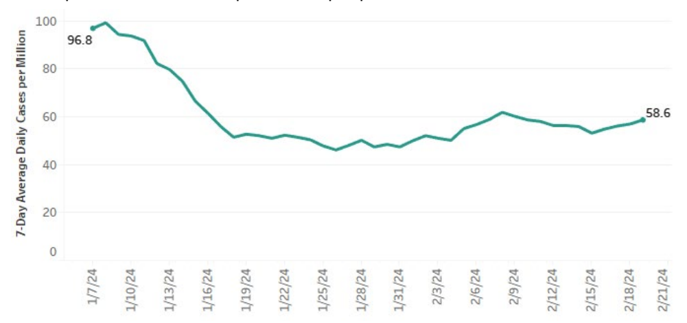
Figure 1: COVID-19 confirmed (daily/1,000,000) cases

The 7-day average rate of new confirmed COVID-19 cases among City of Detroit residents is 58.6 daily cases per million people as of 02/19/2024. This has increased compared to the previous report, when it was reported as 55.4 cases per million people.