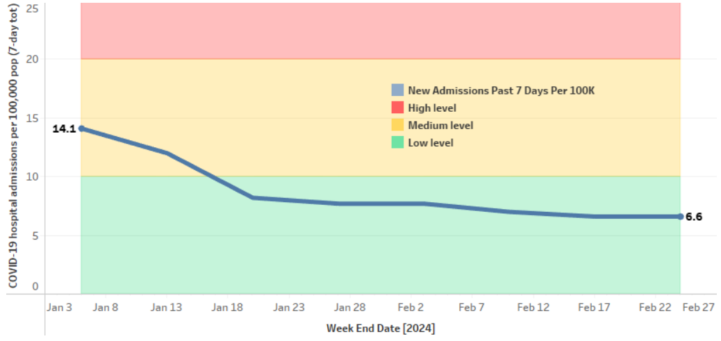
Figure 2: CDC COVID-19 Hospital Admissions Level

The current COVID-19 hospital admissions level for Detroit, Wayne County is Low at 6.6 new COVID-19 hospital admissions per 100,000 population (7-day total).