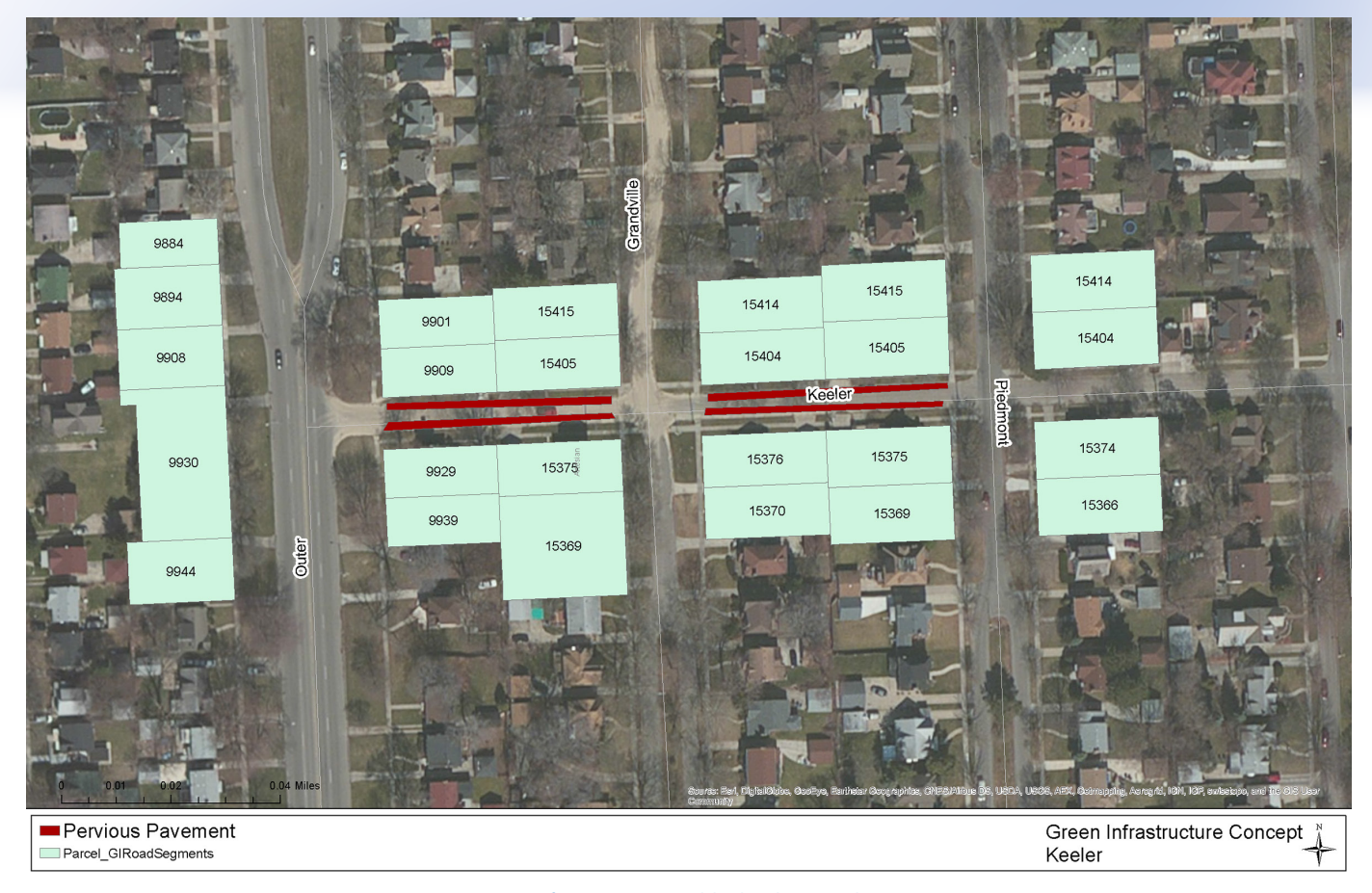
Location of pervious paver blocks along Keeler Street