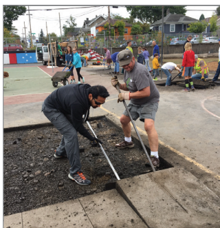
Volunteers removing section of concrete