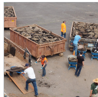
Recycling pavement