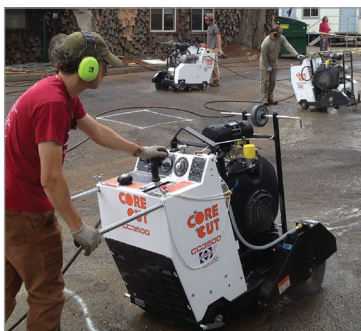
Concrete cutter to remove pavement