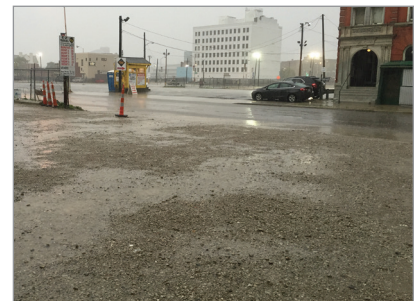
Hard-packed gravel lot