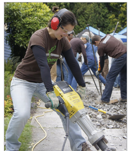
Jackhammer removing surfaces