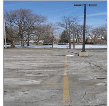
Parking lot with impervious cover

The existing impervious cover that is being removed must also be disposed of properly (preferably reused or recycled), the underlying soil amended, and landscaping installed. Impervious cover (including pavement removal) can generally