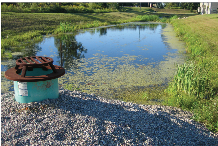
Retention basin with outlet riser in the forefront of the photo