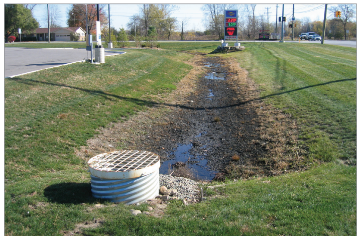
Detention basin with outlet riser in the forefront of the photo