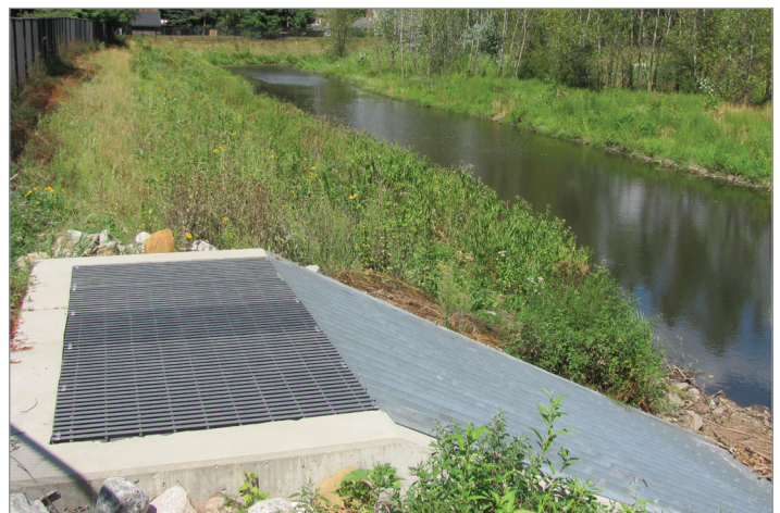
Retention basin with inlet structure in the forefront of the photo