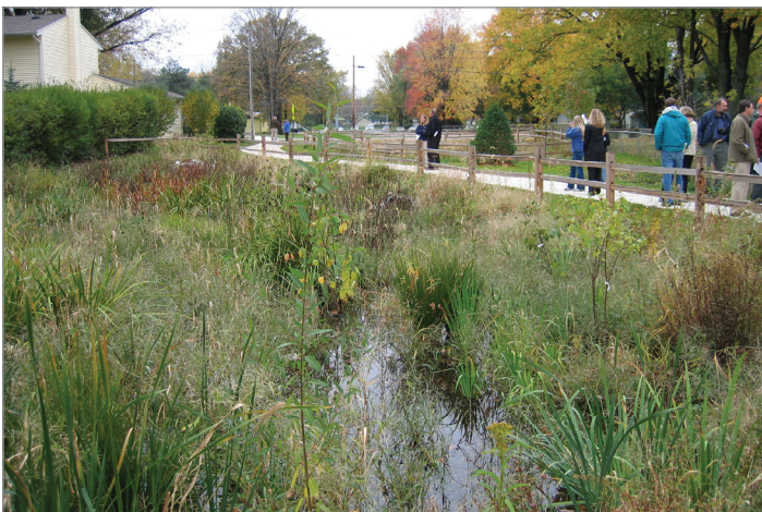
Retention basin with native plants and community walking path