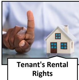
Tenant's Rental Rights