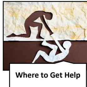
Where to Get Help