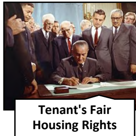
Tenant's Fair Housing Rights