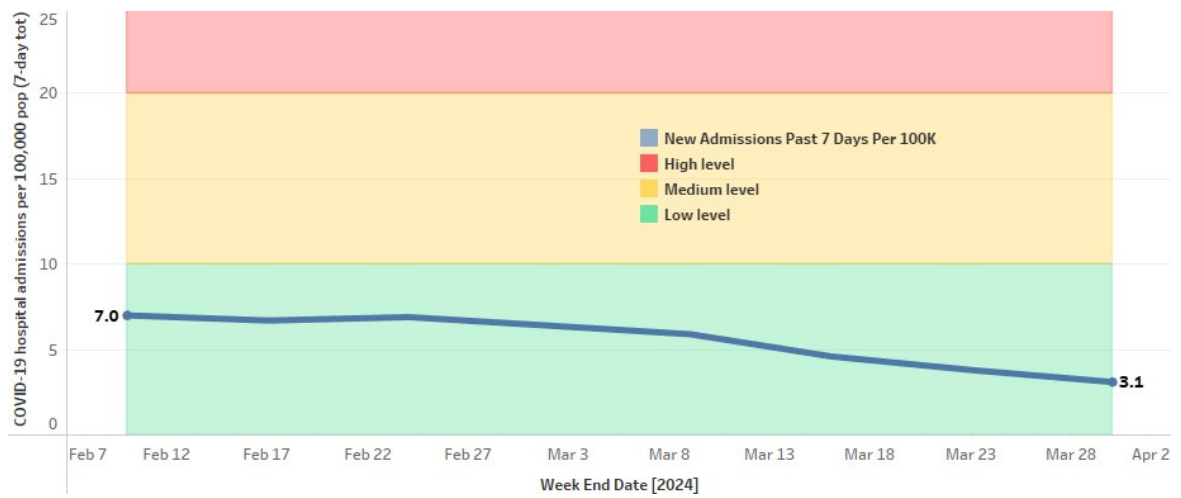
Figure 2: CDC COVID-19 Hospital Admissions Level

The current COVID-19 hospital admissions level for Detroit, Wayne County is Low at 3.1 new COVID-19 hospital admissions per 100,000 population (7-day total).