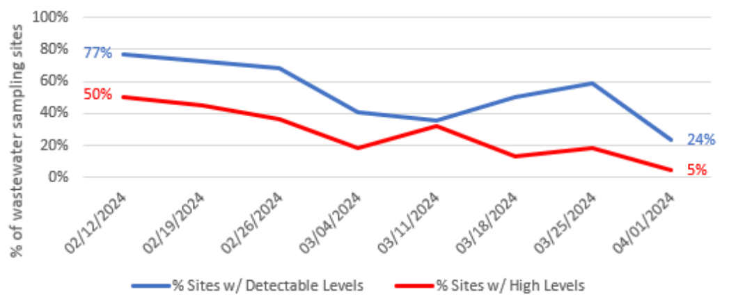
Figure 4: SARS-CoV-2 Wastewater Levels

• The proportions are out of 22 sites across the city of Detroit from which wastewater samples are taken and tested for SARS-CoV-2 markers. Each sampling site represents a specific population based on the area its sewer shed covers, such as long-term care facilities, college dormitories, and entire ZIP code areas. Detectable levels are over 1000 copies/100mL; high levels are over 5000 copies/100mL.