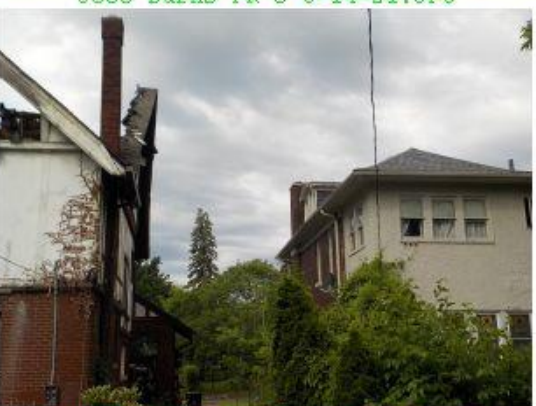
3508 Burns FR d rear 6-14-21.JPG