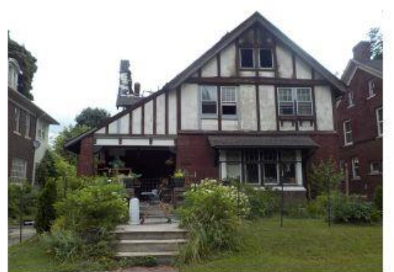
3508 Burns FR a 6-14-21.JPG