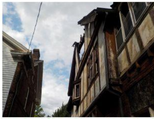
3508 Burns FR b gable rear 6-14-21.JPG