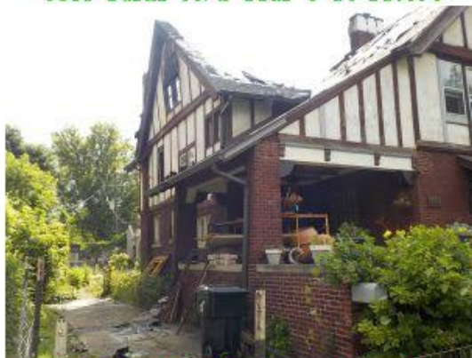
3508 Burns FR d 6-14-21.JPG