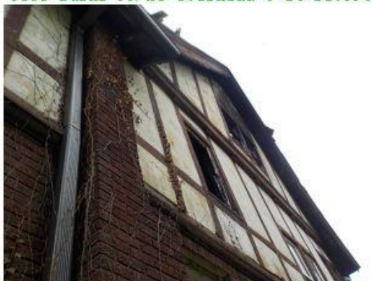
3508 Burns FR d overhead 6-14-21.JPG 3508 Burns FR a 6-14-21.JPG