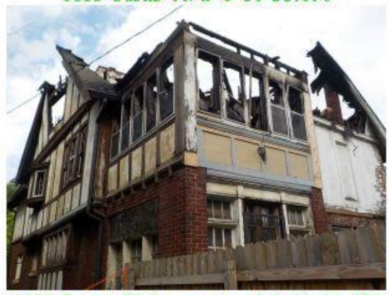
3508 Burns FR bc overhead 6-14-21.JPG