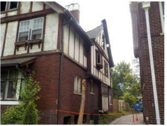
3508 Burns FR b 6-14-21.JPG