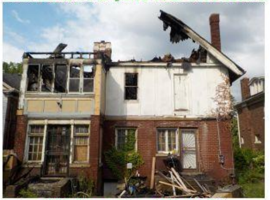
3508 Burns FR c 6-14-21.JPG