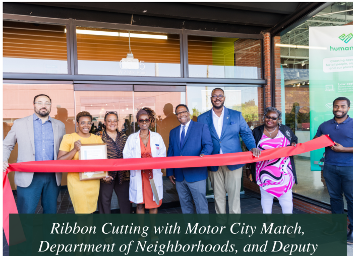
Ribbon Cutting with Motor City Match, Department of Neighborhoods, and Deputy Mayor Todd Bettison

Natural-ish was the recipient of a $65,000 grant from Motor City Match, which supported the building renovations on her new space. It allowed her to open up the location on 7 Mile Road and relocate her business to the city of Detroit from Southfield.