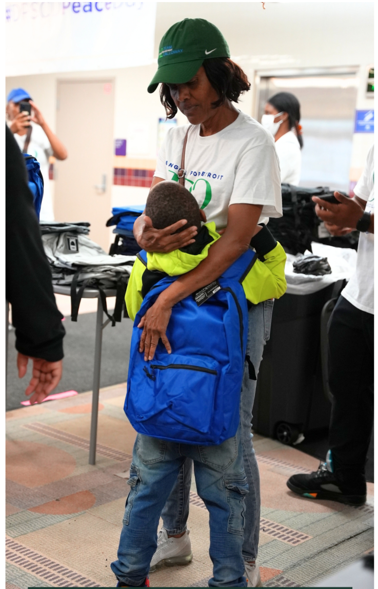
Back-to-School Giveaway on August 25