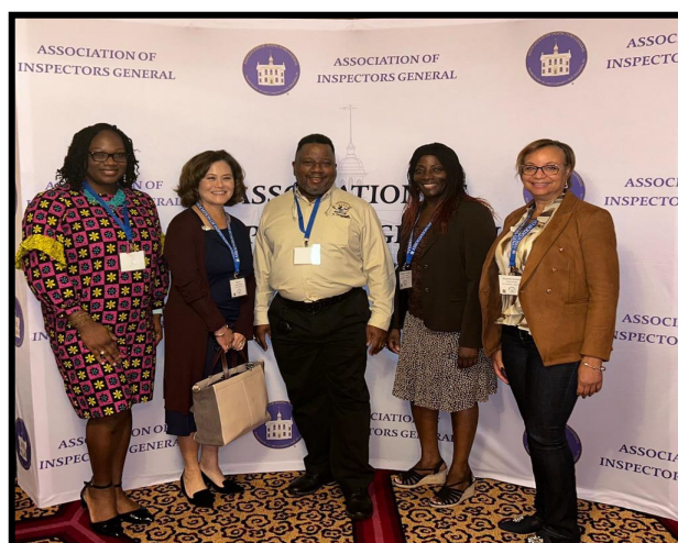
Colleagues at the 2023 AIG Annual Training Conference